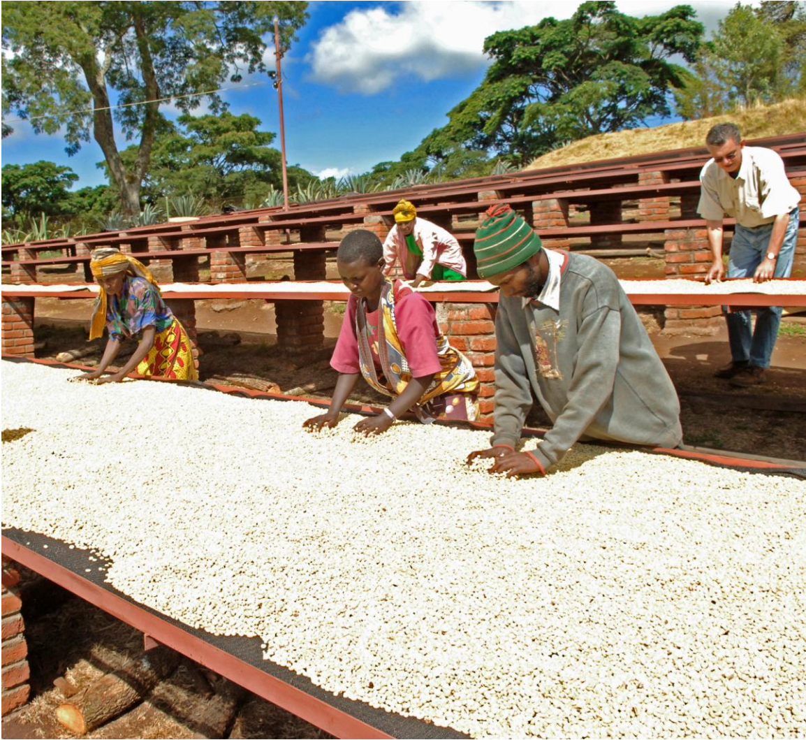
The harvest for Mercanta “Clouds of August” 2011

Lot No.s 26-27-28-29-30-32-44-45-46-48-49-50-51-59