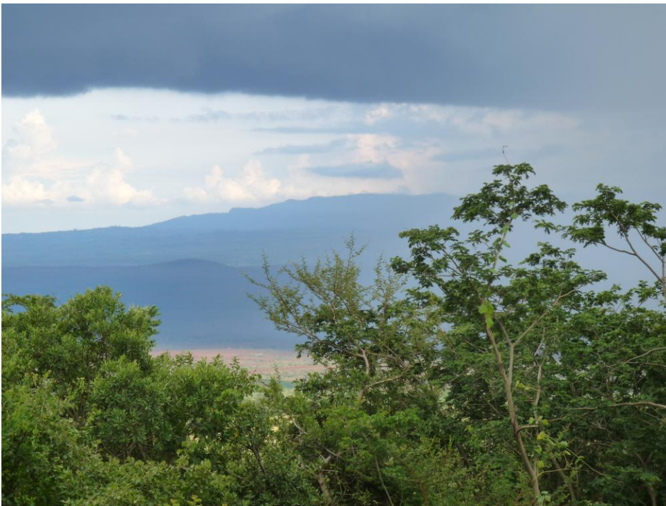
Clouds sweeping in.....