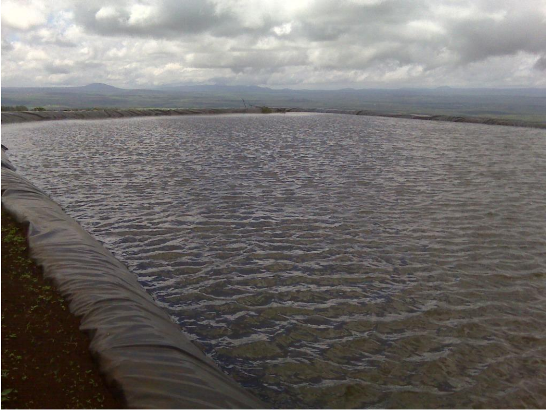
Water, the most important, stored before the dry season starts